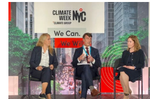
Climate Week NY